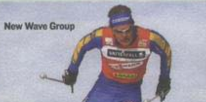
New Wave Group